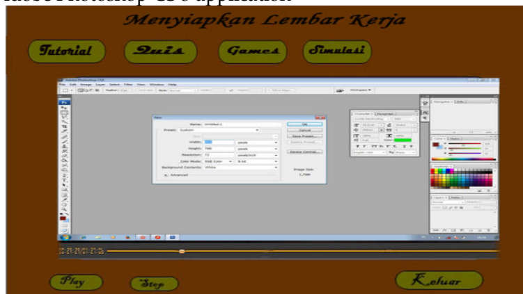
Figure 4. Material Display 2

The 2nd meeting form which contains a video tutorial that explains how to make a worksheet in the Adobe Photoshop CS 3 application