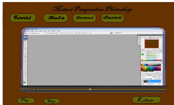
Figure 3. First Material Display

The main form for meeting 1 contains information about the introduction of Adobe Photoshop in the form of video.