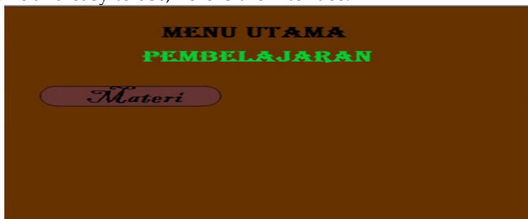
Figure 1. Main Application Display

The main application form is a form that contains buttons that contain sub-menus to run video tutorials, the application is designed to be as attractive as possible as the interface design so that it looks attractive and easy to use, here is the interface.