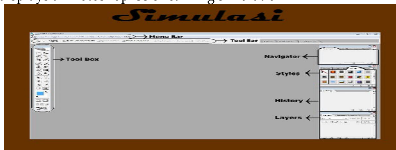
Figure 8. Simulation Display

This form displays a Photoshop CS 3 learning simulation