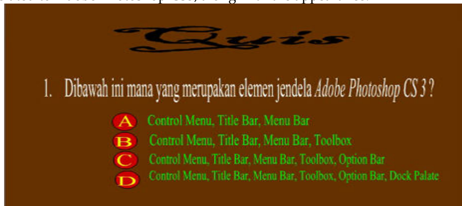
Figure 6. Quis Display

For questions can be seen in the image below, where the material that is entered will contain questions related to Adobe Photoshop CS3, along with the appearance.