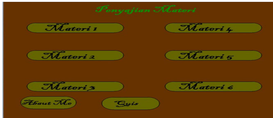
Figure 2. Display For Material Selection